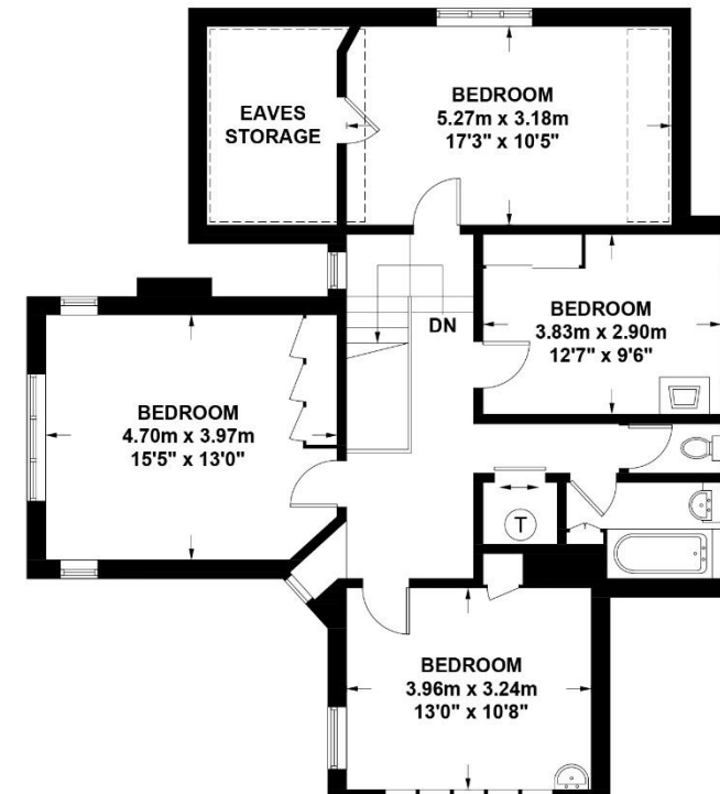
FIRST FLOOR = 983 SQ FT / 91.3 SQ M

This plan is for layout guidance only. Not drawn to scale unless stated. Windows and door openings are approximate. Whilst every care is taken in the preparation of this plan, please check all dimensions, shapes and compass bearings before making any decisions reliant upon them. Cheltenham Home Inspection © 2019